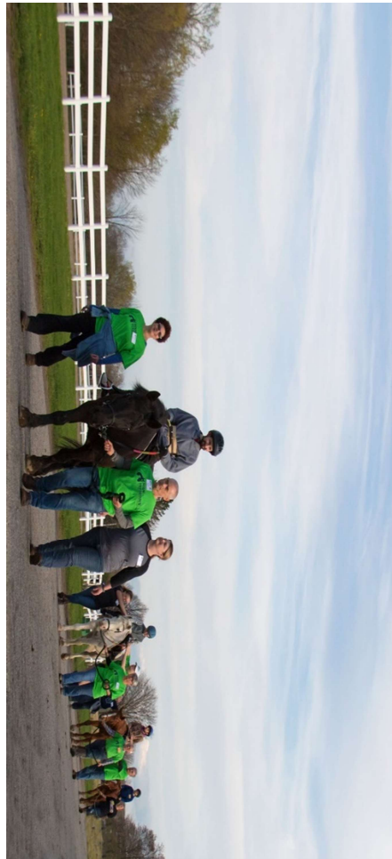
Printing services provided by Staples

2020 Schedule of Events 8:30am – 9:45am Registration Breakfast 10:00am Shotgun Start 3:00pm – 5:00pm Cash Bar Dinner Awards